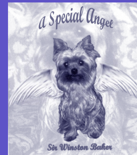
"Sir Winston Baker"